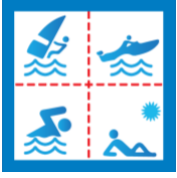
Multiple Beach Activities